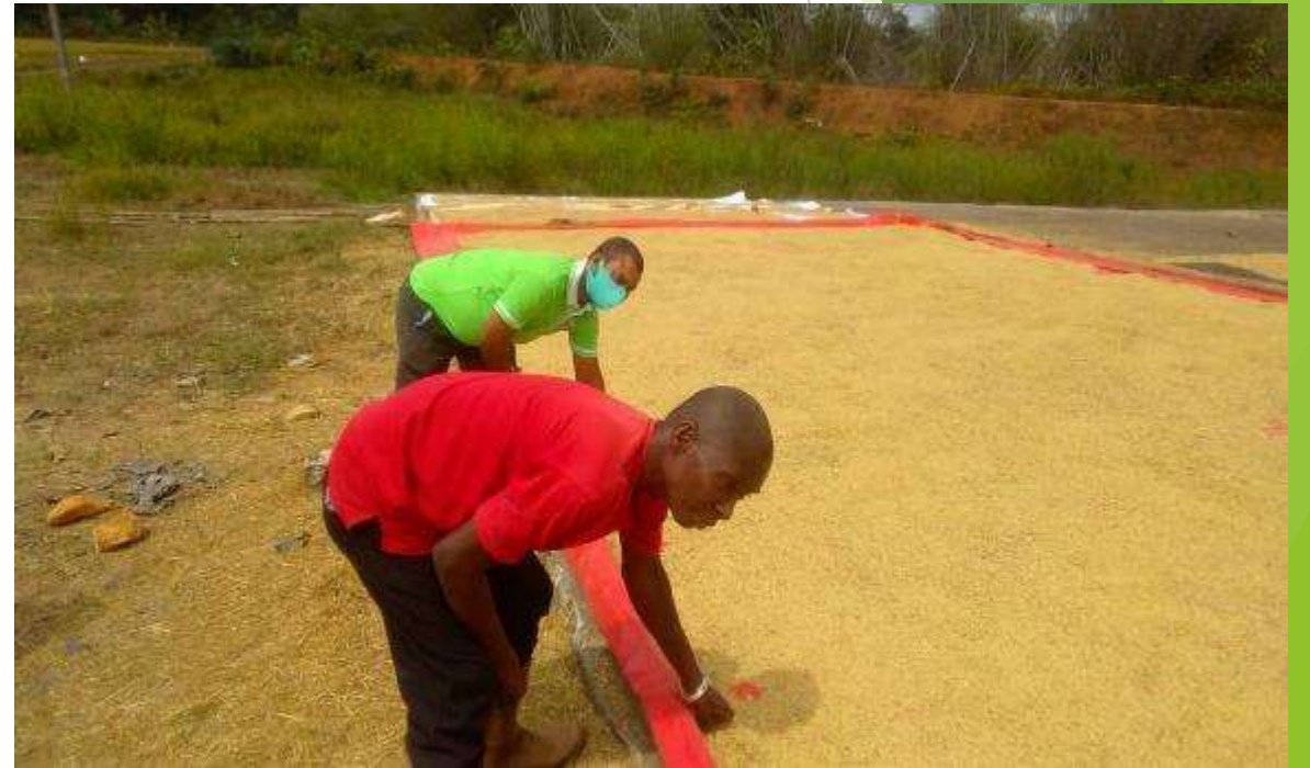
Rice Farm - Simpa