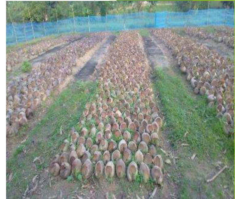
8,500 Coconut Seedlings