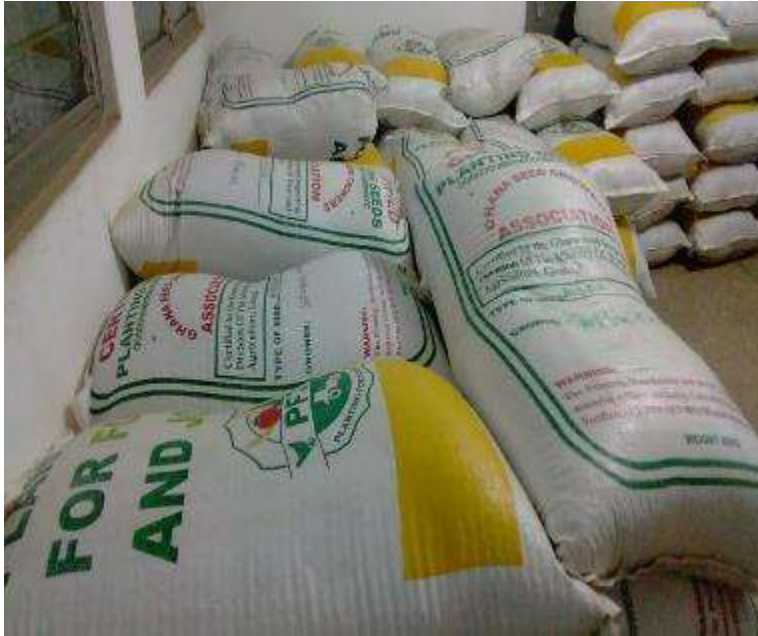
Seed rice (Agra)