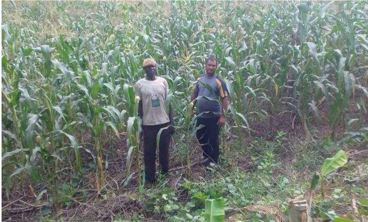
Maize farm - Nsuta