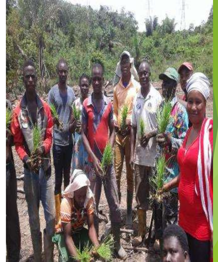
Rice for Transplanting