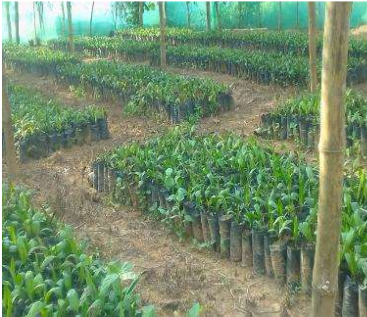
34,000 Oil Palm Seedlings