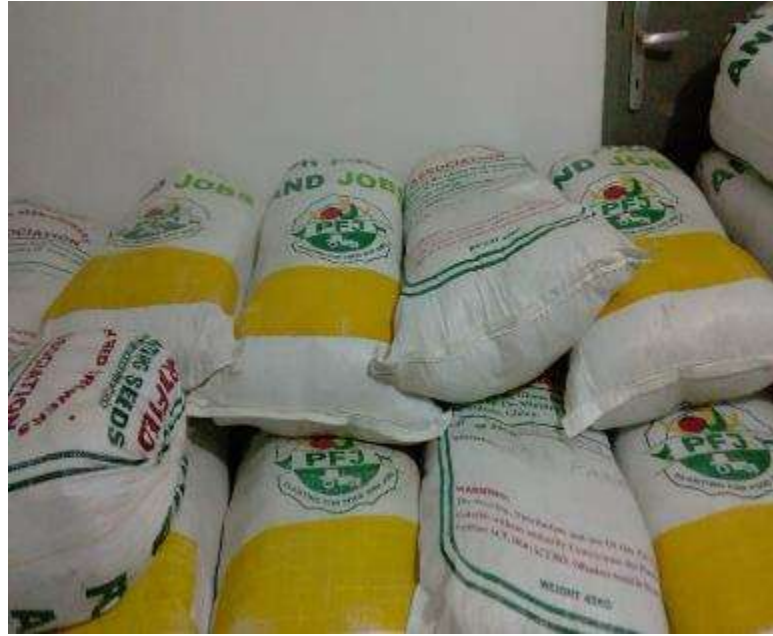
Seed Maize (Obatanpa and Abontem)