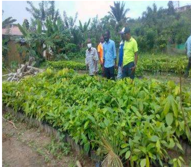
500,000 Cocoa seedlings